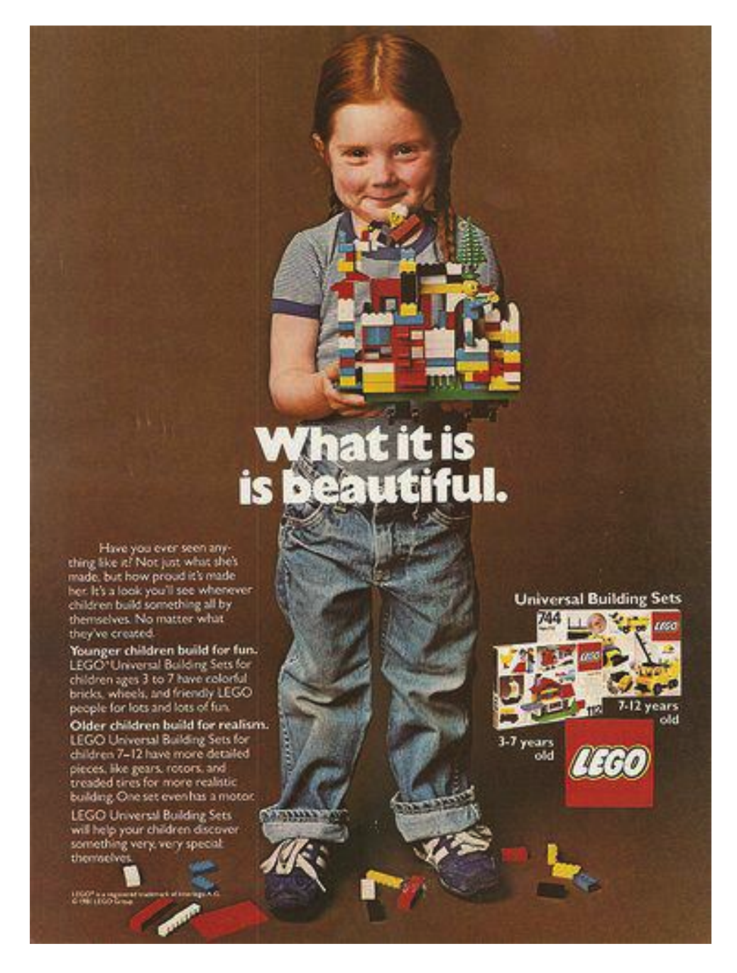
This is the old approach to LEGO toys. It failed because it required too much risk on the part of parents and kids—the risk of making something that wasn't perfect or expected.